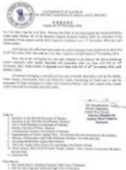
Imphal East Curfew Order.jpeg 60K

Intimation of Manipur Situation_Online Entry Relaxation.pdf 109K