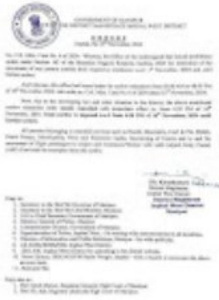
Imphal East Curfew Order.jpeg 60K